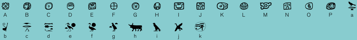
Afrotibet 150 pt